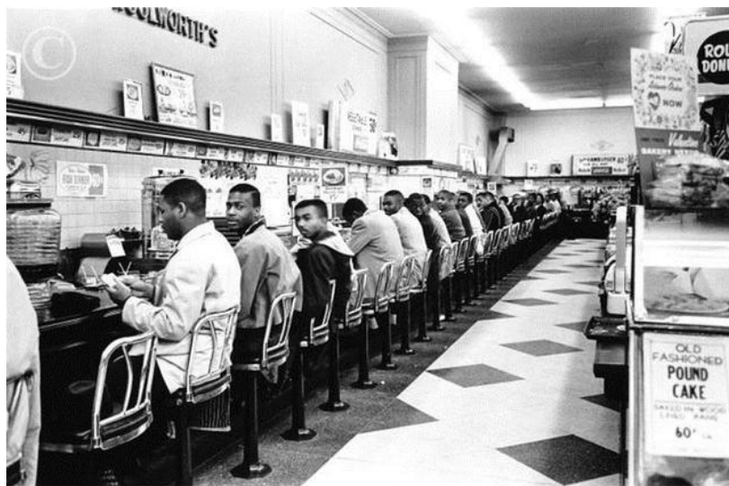
A picture of the sit-ins in Greensboro that started a national movement