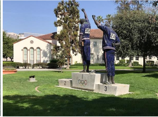
Statue at San Jose State University