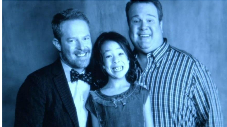
Mitch, Cam and their daughter Lily, Jason Leung, abc.com/shows/modern-family/news/scrapbook/141002-tucker-pritchett-family-photo , [last accessed 24/05/2021].

To conclude this first part, the representation of Black men has been heavily influenced by white supremacy. Because the creation of the African American, or “American Negro” is unique to the United States, the stereotypes surrounding black men reflect how white supremacy perceived them. Indeed, in order to assume their superiority over black men, white men had to push white standards on Black Americans, which meant that subjects like fatherhood, masculinity and sexuality were all seen from a white gaze. Black men could not achieve the white patriarchy and manhood and therefore they felt emasculated and started to internalize these beliefs. In real life, black men could not protect their families nor work in order to be monetary successful, which took away their manhood from a white standard. Therefore, they overtly sexualized themselves in order to prove themselves as men and were sexualized by others as sexual deviants and a danger to white people. On television, this was reflected with stereotyping black men as lazy workers, thugs, and rapists, and created archetypes as The Brute or The Idiot. These representations only furthered the white supremacy ideology and completely ignored the reality of black men, such as the violence they face by the police and criminals on the streets, or the different aspects of black masculinity.