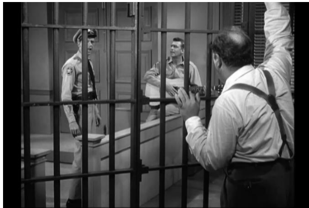
Taylor, Fife and Otis, the town’s drunk. “Crime Free Mayberry”, The Andy Griffith Show, Season 2, Episode 7, CBS, November 20, 1961, Netflix, www.netflix.com/title/70155574 , 0:40.

The professional versus community-oriented policing theory can also be seen in the “Crime-Free Mayberry” episode. Indeed, the episode starts with Otis, the town’s drunk who is the one who spends the most time in the police jail, enjoying Taylor’s singing. When Fife arrives, he admonishes the behavior and compares it to a “nightclub”, whereas Taylor just wants to ensure Otis is well and happy, even though he is in jail. The placement of the camera behind the bars, next to Otis, gives the audience the impression that the ones arrested are the police officers and not the town’s drunk. Otis eventually takes the key to open his cell himself and sees himself out of the building with no problems, once again proving that Mayberry has so little crime, there is no need to distrust the citizens who live there.