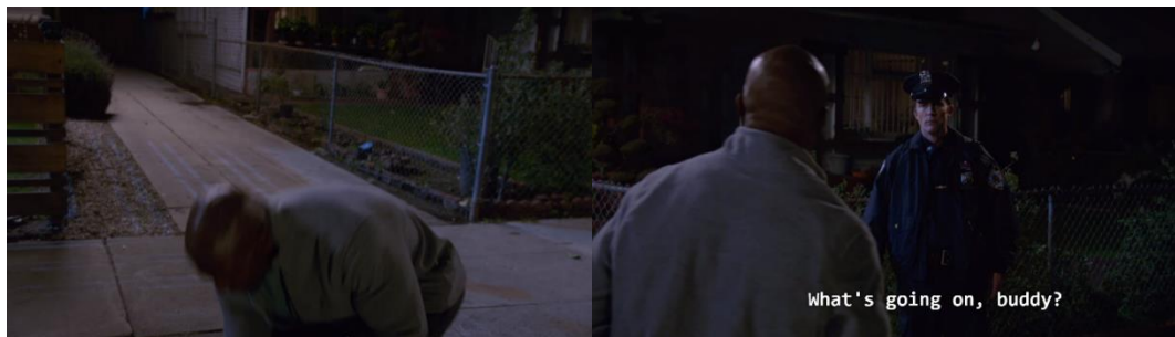
"Moo-Moo", Brooklyn Nine-Nine, Season 4, Episode 16, Fox, May 2, 2017, Netflix, www.netflix.com/title/70281562 , 05:25 – 5:31.

The actual representation of the scene resembles closely to a drama, from the music to the composition. The lightening in the scene is quite dark, as the scene happens at night. From the dark clothes and deep blue uniform, and the darkness that surrounds the characters, the scenes feel quite gloomy and threatening. Before the policemen arrives, the audience sees Terry in a position of vulnerability: alone in the darkness, looking for a toy, giving his back to an unknown threat. The non-diegetic music that is playing at the beginning of the scene changes from a playful tone into an eerie one as soon as the cop appears on the screen. The fact that the police officer is heard before being seen, surging from the offscreen space while Terry is vulnerable, is similar to villains in horror stories, and also contributes to the unsettling feeling.