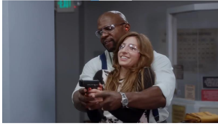
Gina tricking Terry to put his arms around her. "The Vulture", Brooklyn Nine-Nine, Season 1, Episode 5, Fox, October 15, 2013, Netflix, www.netflix.com/title/70281562 , 09:45.

Holt's sexualization is different from Terry's as it concerns his "straight" character, and not his relationship with his husband or the other gay characters. For many reasons throughout the show, Holt acts as a straight man: in flashbacks, he does so to hide the fact that he is gay; and during the "present" time of the show, he acts straight for undercover purpose or to gain something from someone else. Holt's undercover straight character, as Greg in "Coral Palms" (Season 3, Episode 1, 2 & 3) 51 or as Joe Wozniak in "The Big House Part 2" (Season 5, Episode 2) 52 , are both heavily sexualized. Indeed, Holt has to pass as "straight", and therefore comments on fake girlfriend's "heavy breasts" and other secondary sex characteristics such as "thigh gaps" ("That's my favorite part on a woman. There's nothing more intoxicating than the clear absence of a penis." 53 ). His comments are based on the stereotype that men only think about sex and can be linked to hooks' "dick thing" theory presented in part one, where black men are heavily associated with their sexual prowess. However, his overtly sexualized comments about women's bodies are made to bring humor, as Holt is clearly failing passing as straight, and has no idea what to talk about besides sexual comments about women.