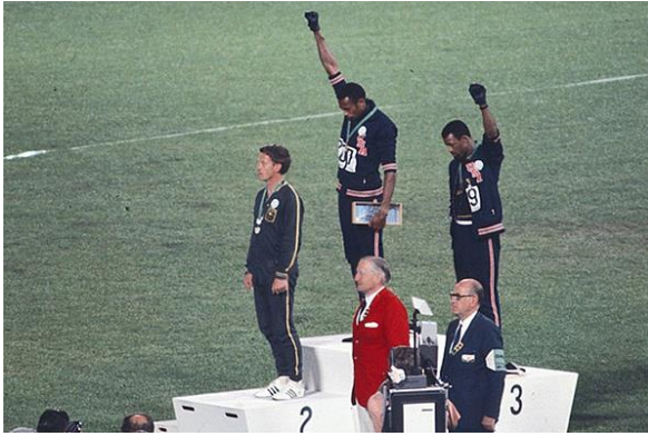
1968 Olympic Games Salute