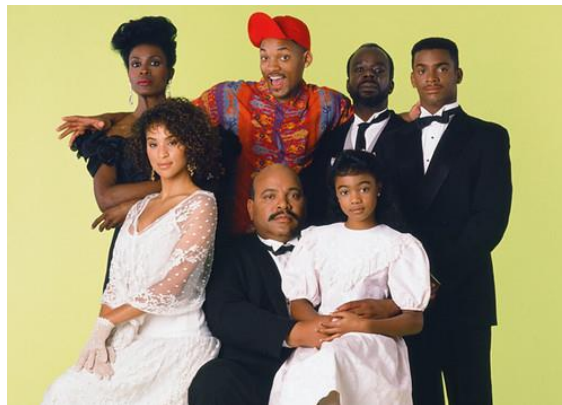
Will Smith, in casual clothes, and the Banks family, in suits and dresses.

A famous character that fit in this archetype is Will Smith, from The Fresh Prince of Bel Air , a young man who is sent to live in Bel Air with his Aunt, Uncle and cousins, after he gets into some trouble in his hometown of Philadelphia. Will Smith does not like homework or school and prefers to spend time with his friends or picking up women to put them in his “chicktionary”. He also deals with his problem through violence, as he learned to do so in the streets of Philadelphia. More recently, the character of Andre Johnson, the father of the family in Black-ish , represent this archetype. Indeed, Andre is afraid that his family forget about their blackness now that they are middle-class. He is eager to show his children what blackness means, in the way they speak, the clothes they wear, etc. Those two characters do not fully conform to the archetype, as Will is also shown as intelligent despite his own refusal to work, and Andre is faithful to his wife and used his intelligence to provide a good life for his family.