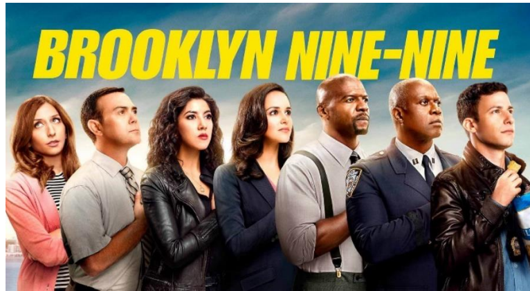
Poster with the main characters. From left to right: Gina Linetti, Charles Boyle, Rosa Diaz, Amy Santiago, Terry Jeffords, Raymond Holt, Jake Peralta. Michael Hitchcock and Norman Scully, the two other main characters, are not pictured, Brooklyn Nine-Nine Fandom Wiki, brooklyn99.fandom.com/wiki/Season_Five , [last accessed 10 May 2021].

B99 is created by Dan Goor and Michael Schur who created many other popular sitcoms (they worked together for Parks and Recreation , Michael Schur also produced The Office , The Good Place ...) and who wrote for many shows ( Saturday Night Live for Schur, The Daily Show , Last call with Carlson Daly and Late Night with Conan O'Brien for Goor). Moreover, the actors are from extremely different background: from very popular movie actors (Terry Crews in comedy action movies and Andre Braugher in dramas), to Saturday Night Live (Andy Samberg) and writers and/or actors of previous sitcoms (Stephanie Beatriz in Modern Family , Joe Loe Truglio in Reno 911 , Chelsea Peretti wrote for Parks and Recreation ...). This ensemble of different genre of actors is very interesting to see in a sitcom. Moreover, we will see in the second part that some of the actors directly impacted the character's portrayal.