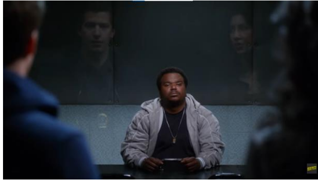
Doug Judy's first apparition. "The Pontiac Bandit", Brooklyn Nine-Nine, Season 1, Episode 12, Fox, January 7, 2014, Netflix, www.netflix.com/title/70281562 , 01:50.

However, Judy's intimidation ends a few seconds after his first apparition, as he is shown serenading to Rosa, and then playfully bantering with Jake during the interrogation. Eventually, the squad, and the audience through them, becomes friend with him. Judy has a very similar attitude to Jake's: they are both funny, try to mimic their favorite movies in real life and love the action that their jobs put them through. The only difference is which side of the law they are on, and even that changes as Judy redeems himself after a few seasons, showing that the police is the "good" side to be on, even for criminals. This can be related to the concept of identification: the viewer is offered multiple "surrogate figures" which they can project onto and model their reactions and affects. As Jake is the main character, he is the one figure that the audience will model the most. Therefore, as Jake gradually stops seeing Judy as a criminal and starts being his friend, the audience does the same.