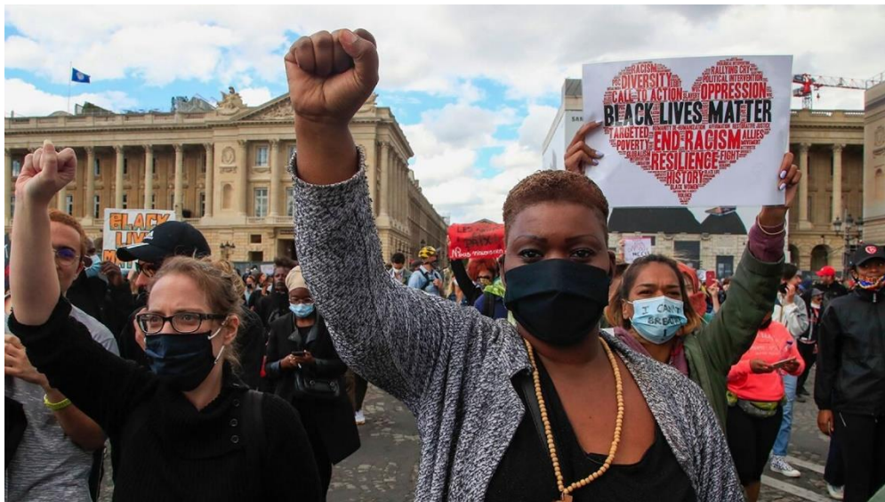
Paris France