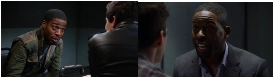
Left: “48 hours”, Brooklyn Nine-Nine, Season 1, Episode 7, Fox, November 5, 2013 Netflix, www.netflix.com/title/70281562 , 05:10.

has multiple differences. For once, it shows the Black man suspect of the crime enter the police department willingly instead of being arrested on the street for making a joke about Jake. Instead of just being a thief, such as in the “48 Hours” episode, or a known criminal in any shape or form, which is the usual stereotypes for Black Men in media, Phillip Davidson is a successful dentist, his intelligence and wit surpassing both Holt’s and Jake’s. It makes Davidson a smart enemy to defeat as the clock ticks, instead of a kid to trick by getting around the law. Also, when “The Box” episode aired, viewer then knew Jake for five seasons and had no reason to doubt he is one of the “good guys”. The audience had sympathy and believed in him, and therefore when he arrests someone with no evidence, there is no reason to believe that he is wrong. “The Box” was an attempt to fix their past mistake and show a better version of the same trope.