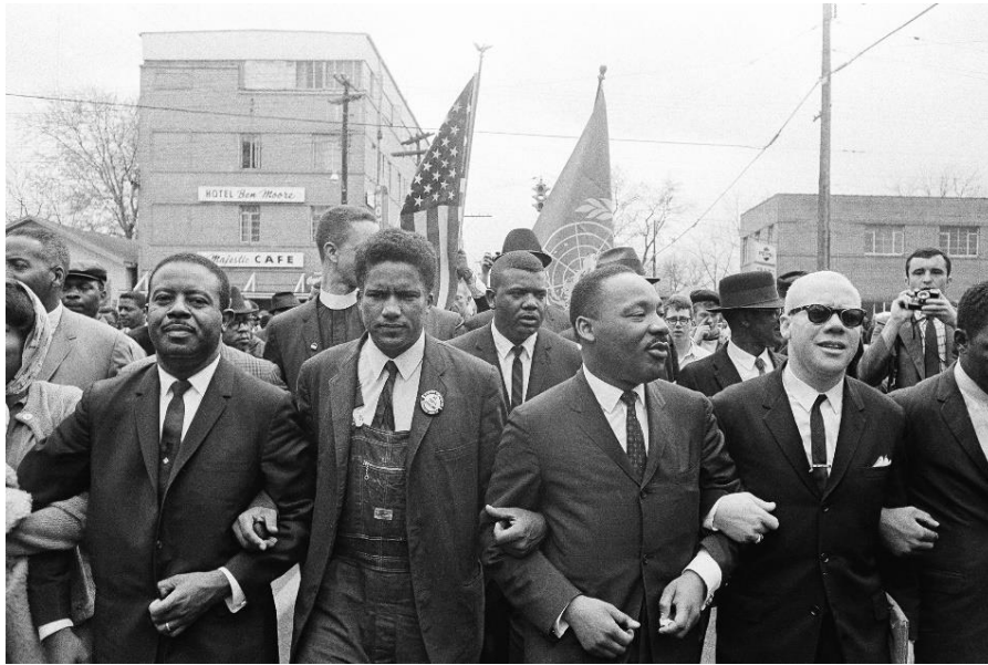
MLK leading the Selma march