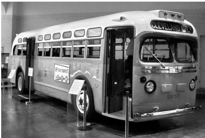
The bus Rosa Parks sat on and started the Montgomery bus boycott