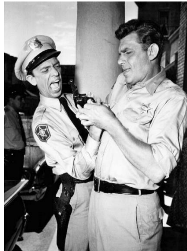
Sheriff Andy Taylor helping Deputy Barney Fife whose finger is stuck in a revolver. Wikipedia, wikipedia.org/wiki/The_Andy_Griffith_Show , [last accessed 24 May 2021].

show “had a feeling of the 30s”. 2 By using past period (the 30s), even in the time they filmed it (the 60s), the show gave its audience a sensation of nostalgia. The characters remained pure, and in a town where almost no crimes happened, Mayberry seems like a safe haven compared to the tragedies and social issues that people faced in that decade. The show is still popular today, being on the air constantly since its creation to the 2000s, and now available on platforms such as Netflix and Amazon Prime.