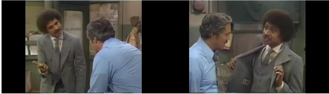
“The Harris Incident”, Barney Miller, Season 6, Episode 5, ABC, November 30, 1978, Amazon Prime, www.amazon.com/gp/product/B001AM2LN6?tag=deciderrg-20 , 04:55, 08:00.

For example, the laugh track can be heard when Harris says that he heard the other police officers saying “Police! Drop it.”, or when Harris sarcastically answers Miller’s questions: Miller: “What did you do?” Harris: “Well, not being invincible, I dove.”, Miller: “The hospital? They were hurt?” Harris: “Well, I tried.” [laugh track]. Harris himself interrupts the story to give him details about his gun’s improvements being broken and his clothes being ruined, as Harris is known to be vain and fashionable. All of this gives the impression that what happened to Harris is not that grave, as everything is made to make the audience laugh.