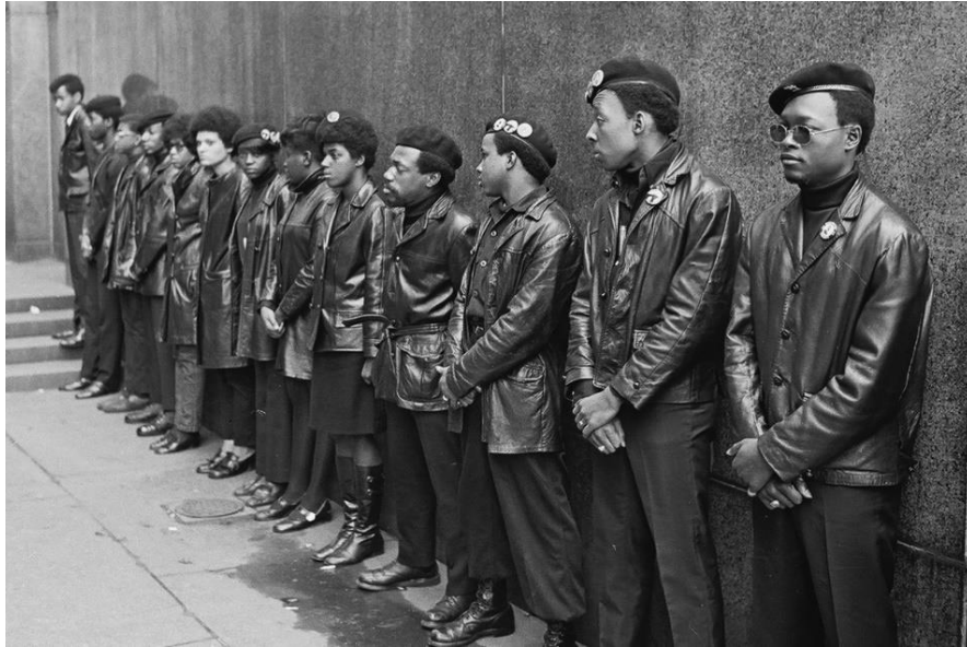
A picture of some members of the Black Panther Group