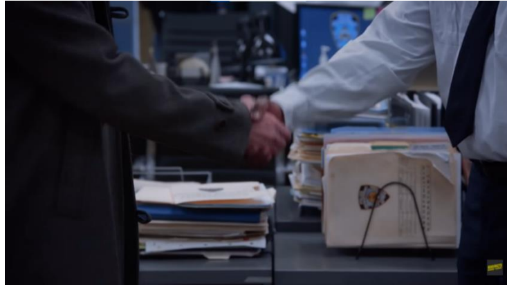
Kevin and Holt's "PDA in the office". "The Bimbo", Brooklyn Nine-Nine, Season 6, Episode 13, NBC, April 18, 2019, Netflix, www.netflix.com/title/70281562 , 1:20-1:30.

But his sexuality is not taboo, indeed, it is talked as much as any other character's. The most evident example of it is the "Skyfire Cycle" episode (Season 4, Episode 5) 59 , which deals with Kevin and Holt's relationship which is suffering from the night shift, and Rosa tells Holt they "just need to bone", which indeed resolves their problems.