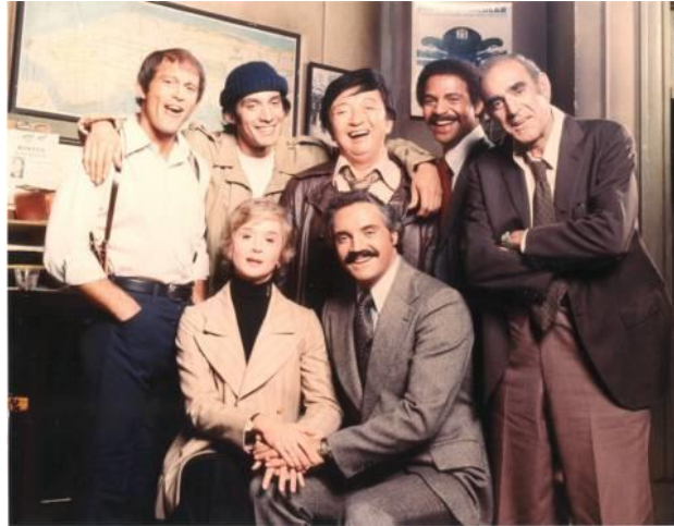
A picture of BM's squad. From left to right, top row: Wojo, Chano, Yemana, Harris, Fish. Bottom row: Liz and Barney Miller. Sitcomsonline.com, www.sitcomsonline.com/photopost/showgallery.php/cat/706 , [last accessed 10 May 2021].

Barney Miller was considered “the straight man”: he is “the one ‘normal’ character in the work group, the long suffering official who must tolerate the daft behaviour of the leading characters”. 14 The squad is compared to him and look up to him, but he is also a Jewish man who is compassionate and a father figure to some characters such as Wojo. According to Linden, Arnold specifically chose him to play Miller without even auditioning for it first because he had “a sense of Talmudic justice” that Miller needed in order to be compassionate and patient with the squad. By using Jewish culture to create a Jewish character, instead of focusing on stereotypes, Arnold created a character that goes against traditional Jewish stereotypes (such as villainy and selfishness).