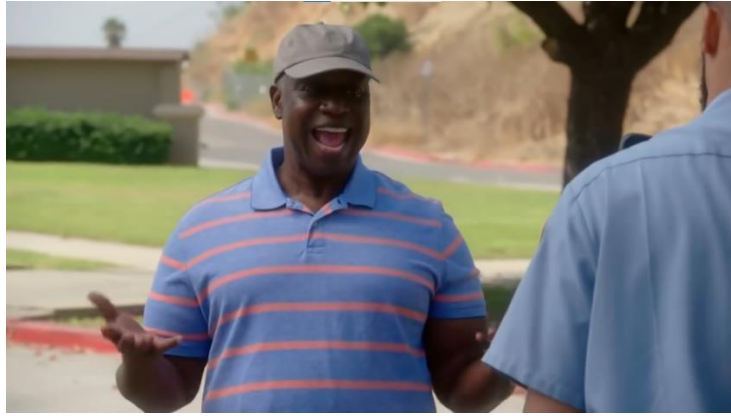
Holt gesturing about the size of his fake girlfriend's "heavy breasts". "The Big House: Part 2", Brooklyn Nine-Nine, Season 5, Episode 2, Fox, October 3, 2017, Netflix, www.netflix.com/title/70281562 , 11:13.

Holt is also seen as very charismatic and attractive by many women in the show. Holt does not shy away from this and instead uses it to his advantage, for example to charm a female judge to rush a meeting in "Charges and Specs" (Season 1, Episode 22) 54 . Holt's former partner and nemesis, Wuntch, also fell for him when they worked together and Holt's refusal "to bed her" 55 (Season 2, Episode 2, "Chocolate Milk") was thought to be the reason for their animosity.