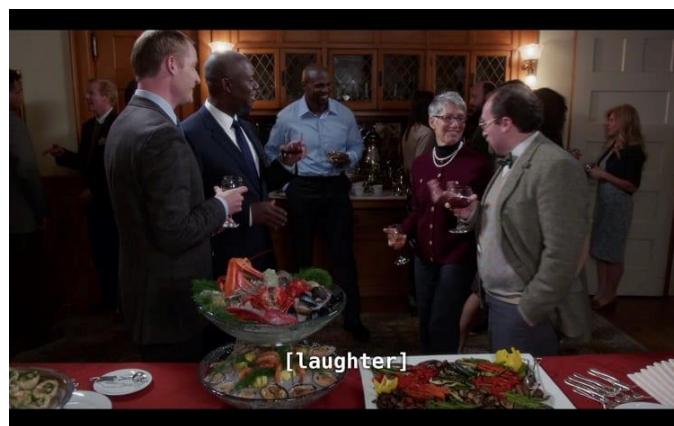
Captain Holt's house. "The Party", Brooklyn Nine-Nine , Season 1, Episode 16, Fox, February 4, 2014, Netflix, www.netflix.com/title/70281562 , 08:03.

Their home life is not often seen in the show, as it focuses mostly on the precinct and their jobs, however the audience can see that their home lives are also very different. Whereas Terry is sometimes seen as struggling financially because he takes care of his children and their future, Holt lives a quite luxurious life with his husband Kevin, in their nice home. In the episode "The Party", the squad notices the expensive taste of the Captain and how he conforms to higher social class standards; Holt likes classical music, reads The New Yorker and watches operas.