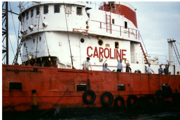
Fig. 8 86

The Marine, &c. Broadcasting (Offences) Act of 1967, chapter 41 87 , stated that broadcasting from any ship or aircraft within UK, its sea limits and the international waters was prohibited. It redefined the limits of its maritime territory and defined the terms of ship and aircraft in clear terms. This way, pirate radios would have less chances to be left unpunished.