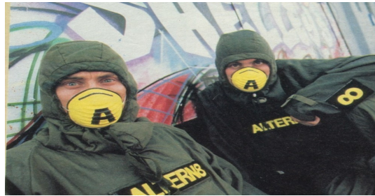
Fig. 2: Altern-8 39

In this picture, we can clearly see two men wearing face masks covering half of their faces, alongside what is said to be “biohazard suits” 40 . This trend went on and on, and artists from the Electronic Dance Music scene began to create aliases more and more often by creating face masks that covered only a bit of their faces but also the whole of it for some of them. Even though they are not British, if we discuss the wearing of a mask one will probably think about the emblematic French duo of EDM producers Daft Punk. Known all over the world, Daft Punk is a well-known duo because of their music of course, but also because, or thanks to, their helmets, that are their trademark.