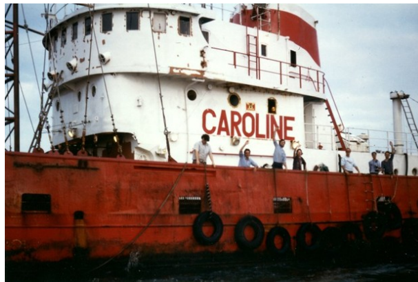
Fig. 8 86

The Marine, &c. Broadcasting (Offences) Act of 1967, chapter 41 87 , stated that broadcasting from any ship or aircraft within UK, its sea limits and the international waters was prohibited. It redefined the limits of its maritime territory and defined the terms of ship and aircraft in clear terms. This way, pirate radios would have less chances to be left unpunished.